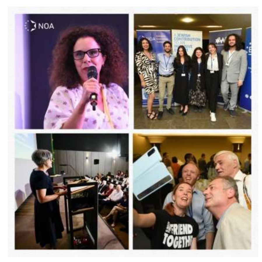
NOA (Networks Overcoming Antisemitism) European Conference in Brussels

The EUPJ Foundation is partnered with four other founding organisations, including the World Jewish Congress (WJC), the European Association for the Preservation and Promotion of Jewish Culture and Heritage (AEPJ), B'nai B'rith Europe, and the European Union of Jewish Students (EUJS). It is coordinated by CEJI – A Jewish Contribution to an Inclusive Europe.