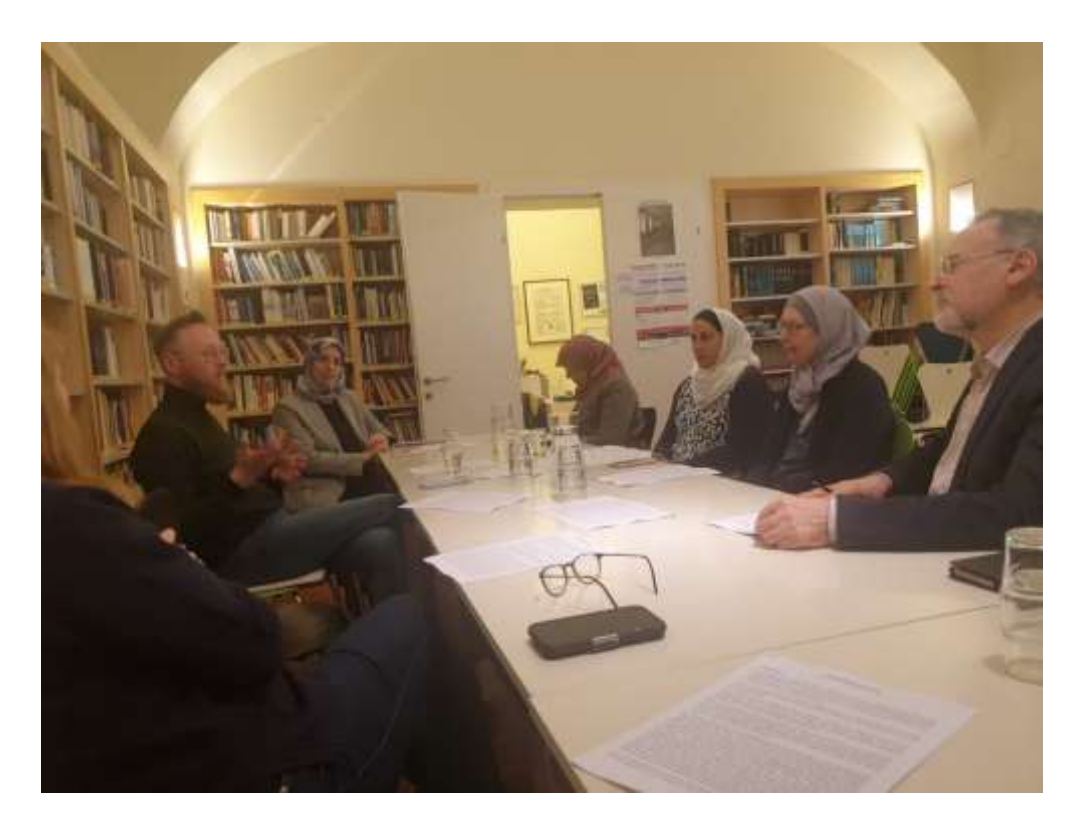
In Vienna, Jüdische Liberale Gemeinde Wien - Or Chadasch's interfaith coalition is making strides